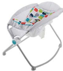
Above: Figure 1

32. A critical common design element of the Rock 'n Play Sleeper is a collapsible frame that supports a fabric hammock with tall sides (Figure 1), forcing the infant into a reclined position, with the head elevated at an approximately 30-degree angle from the lowest part of the baby's torso (Figure 2) and restraints (Figure 3) that, if used as Defendants recommend, limit the baby's motion at the hips and waist. There is a hard plastic shell inside the hammock that is covered with soft padded material (Figures 4 and 5), upon which the baby is placed. Different views of the product are shown below: