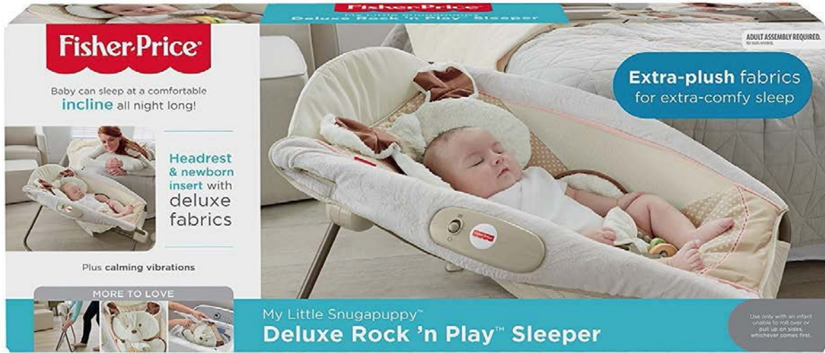
Above: Figure 6