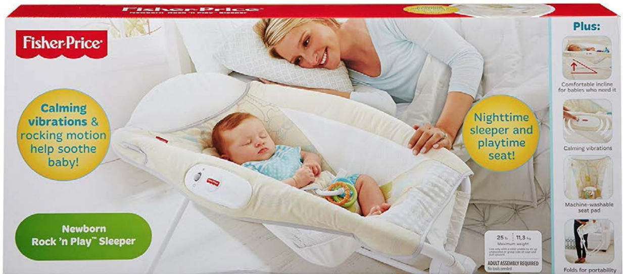
Above: Figure 7