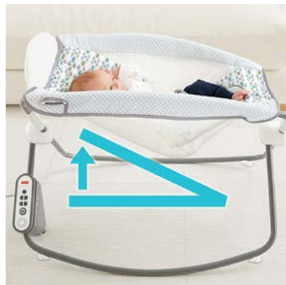
Above: Figure 2