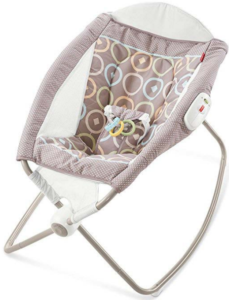
Above: Figure 4